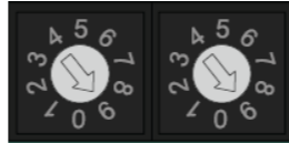
Example: Rotary Switch showing ID No. 99.

You can choose any numbers you wish up to 99 but no 2 units within radio range can have the same number